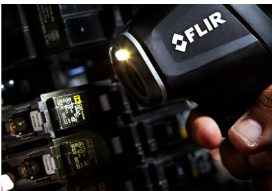
TG54 and TG56 feature powerful LED worklights