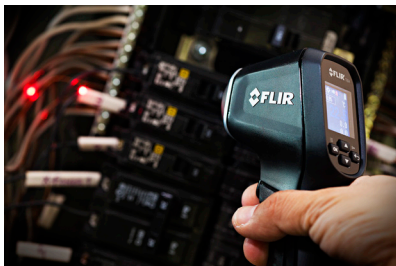
Easily identify measurement location with built-in laser