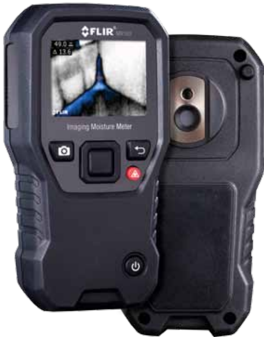
MR160 Imaging Moisture Meter