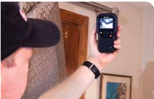
FLIR MR160 scanning ceiling & wall joint for moisture issues.