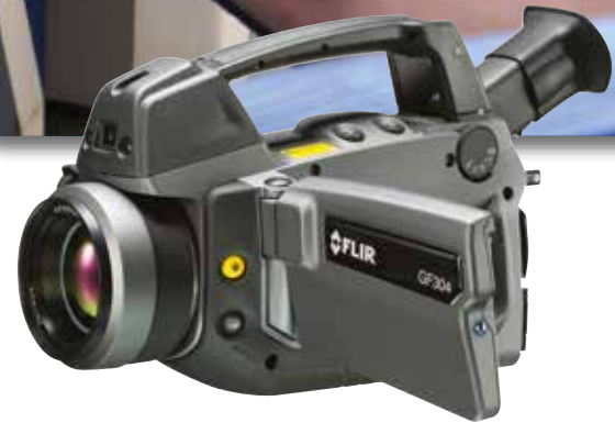
The GF304 gas imaging camera was especially developed for the detection of refrigerant gases without the need to shut down the operation.

Martin Popowicz, Integral's leading figure in thermal imaging is, an avid promoter of FLIR technology: "We have been using the FLIR thermal imaging camera on