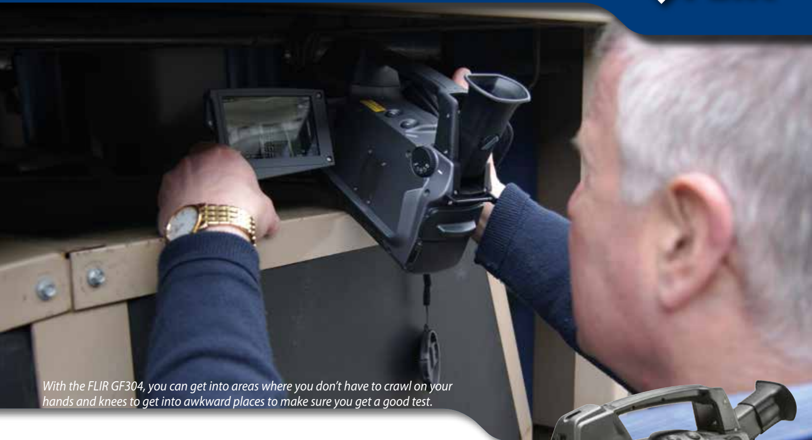
With the FLIR GF304, you can get into areas where you don't have to crawl on your hands and knees to get into awkward places to make sure you get a good test.