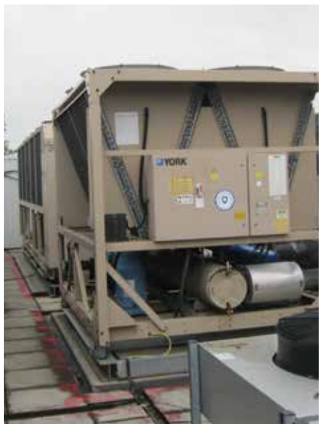
Because of wear or damage, chillers can present leaks, through which refrigerant gases can escape.

For more information about thermal imaging cameras or about this application, please contact: