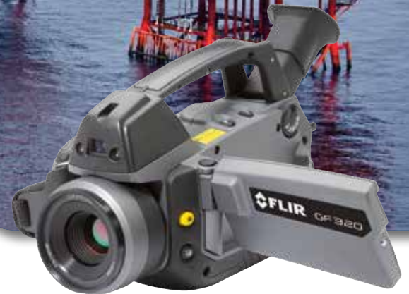
The FLIR GF320 Optical Gas Imaging (OGI) camera

Established in 1981, Inspectahire is a leading international supplier of specialist remote visual inspection technology and solutions to companies in many industries around the world. Supported by the most advanced technologies around, Inspectahire helps its customers manage their safety, profitability and environmental impact of their assets. When the company is tasked with the detection of fugitive hydrocarbon emissions, FLIR's GF320 Optical Gas Imaging (OGI) camera is their preferred technology to use.