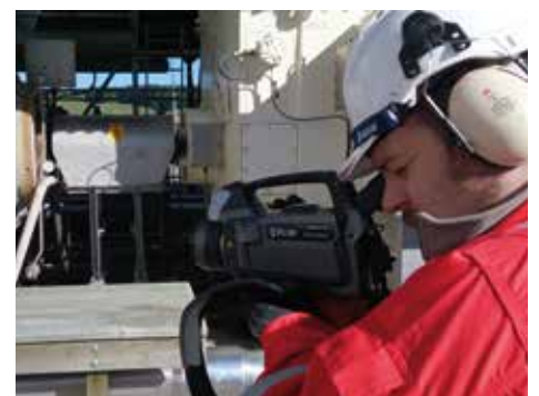
Thanks to thermal imaging cameras, Inspectahire can easily detect gases in difficult to reach or hazardous locations.