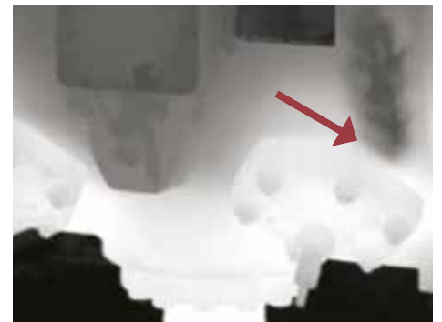
Inspectahire has been using thermal imaging cameras for a long time to detect dangerous gas leaks.