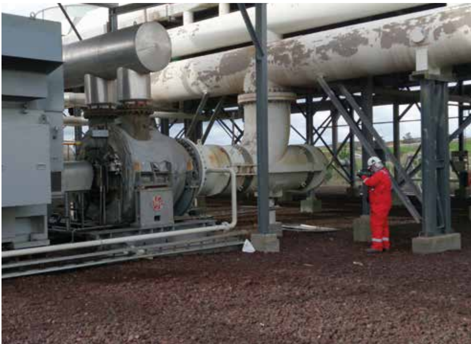
Small leaks can become big ones, that is why it is important to be able to detect them in an early stage.

"The camera is very ergonomic and very sensitive," comments Cailean Forrester. "If a hydrocarbon leak is there, you will certainly see it with the GF320 camera, even if it is a small one. Small leaks can become big ones, that is why it is important to be able to detect them in an early stage. With the GF320, we are sure of an accurate and reliable detection."