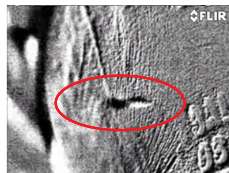
With the FLIR GF306 insulators containing SF 6 gas can be easily detected from a safe distance.