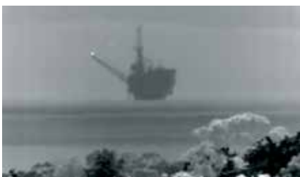
Visualizes subjects obscured by fog