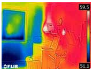
Uninsulated outside wall

The FLIR C2 includes FLIR's revolutionary Lepton ® micro-thermal camera that can passively scan an area and display images of hot and cold patterns on its LCD screen. Along with the Lepton, C2 also includes a visible light camera for capturing photos of the scene. Using FLIR's exclusive MSX ® technology, C2 embosses the thermal contrast details from the visual camera onto the thermal image without diluting it. The end result is a thermal image that shows identifiable features, numbers, letters and other texture so you know immediately what you're looking at in a scene.