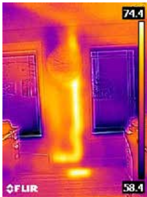
Warm drain pipe in wall