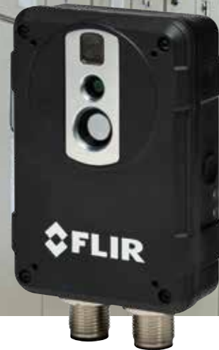
The AX8 combines a thermal and a visual camera in a small, affordable package.