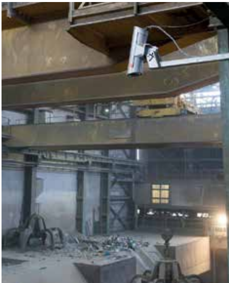
At the ZEVO Malešice plant, two FLIR A615 cameras, installed in a protective housing, monitor the storage tank for hot spots that indicate possible starting fires.

Waste fires are a genuine threat in waste incineration plants and this is also true for ZEVO Malešice. The most common causes of fires at waste incineration plants are spontaneous chemical combustion of waste and hot particles given off by the vehicles that collect the municipal waste. A contributing factor to the risk of fire or devastating explosion is the increased concentration of methane, which is released from the waste during the decay process. In order to reduce the risk of fires, the ZEVO Malešice plant decided to invest in the Waste Bunker Monitor system from Workswell. The main goal of the system is to monitor the plant's waste storage for emerging fires.