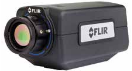
The FLIR A6750sc perfectly captures subtle temperature changes that are associated with human emotions such as stress.

The ISMS is a non-invasive stress analysis system, that includes a thermal camera in the cockpit pointed at the pilot, and a dedicated workstation with software that can extract and analyze the collected thermal facial data. The camera will monitor facial temperature modulation of the crew while performing typical pilot tasks. The system is especially relevant for mission tasks where pilots need to process a lot of data in real time coming from multifunction displays, helmet mounted displays, and multi-function keyboards.