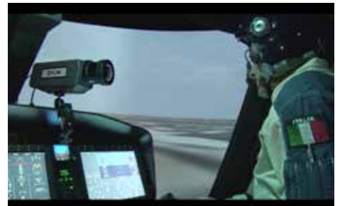
The ISMS helps Leonardo understand stress imposed on pilots during missions, either in simulators or in real missions.