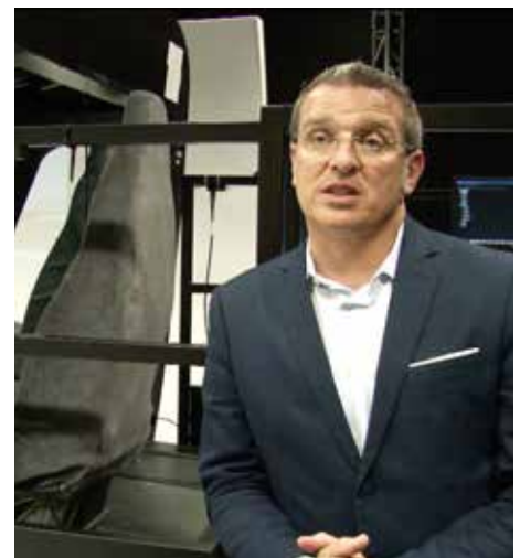
Prof. Arcangelo Merla: "The ISMS project is unique in that it is the first time that thermal cameras are used for monitoring pilot behavior."

Arcangelo Merla: "The ISMS also uses Functional Near-Infrared Spectroscopy or fNIRS to monitor cognitive brain activity, while thermal imaging is used to estimate the emotional impact. As such, the ISMS manages to monitor both cognitive and emotional processes in real time during flight missions or simulations. This is truly a breakthrough. The technology has become mature for monitoring everyday human machine interactions in automotive or robotics applications."