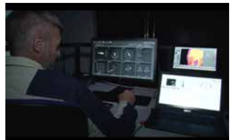
The ISMS enables Leonardo to capture stress information in every pilot maneuver.