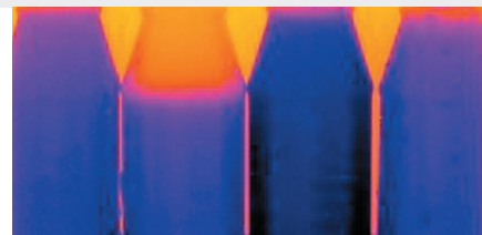
Detecting liquid levels in visually opaque bottles.