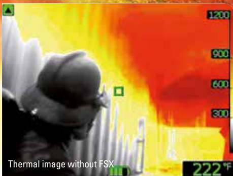
Thermal image without FSX

* after product registration on www.flir.com