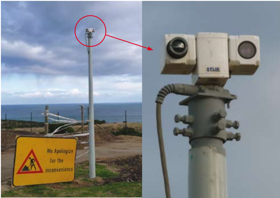
One of the FLIR Systems PTZ-50 MS thermal imaging cameras overlooking Oubaai.