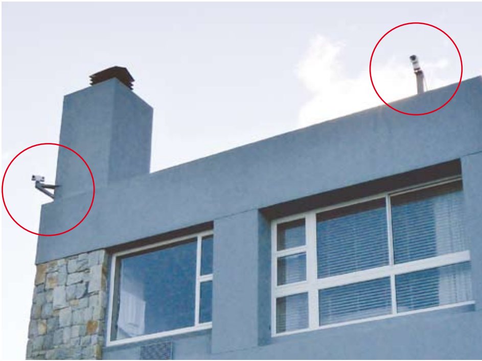
For aesthetical reasons some FLIR Systems thermal imaging cameras are mounted on a house instead of on a mast.

"RAFID is a more aesthetical solution than fences but it is a fairly expensive system. Not only are full civil works needed to install the cables, once in operation the system requires a lot of maintenance. And although the system can make a difference between a man and a small animal entering the security perimeter, a lot of false alarms can happen. This means that the RAFID needs to be complemented with a CCTV system so that an operator can determine if an alarm is false or not," Andre explains.