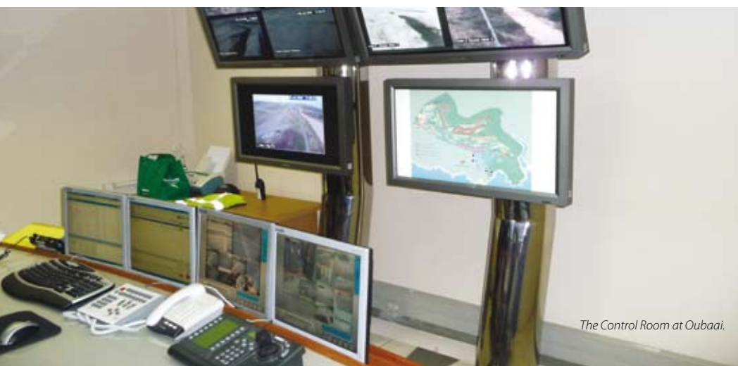
The Control Room at Oubaaï.

For more information about thermal imaging cameras or about this application, please contact: