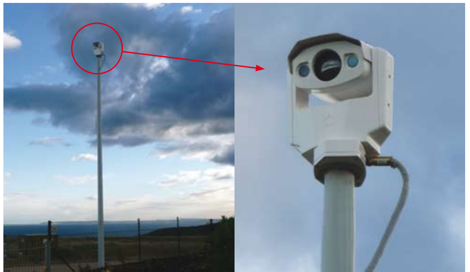
The FLIR Systems PTZ-35x140 MS. It contains 2 thermal imaging cameras and one daylight/lowlight camera. It overlooks a big part of the Oubaai estate.

"The main reason for purchasing the FLIR Systems thermal imaging cameras was securing the Oubaai estate. Once they were installed it became clear however that they can have another, sometimes live saving, capabilities."