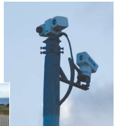
A PatrollIR and PTZ-50 MS mounted together on a mast to secure the perimeter

If you require more information please contact Timeless Technologies: www.timetech.co.za/ or Holbert Boikanyo Technologies: www.holbert.co.za/